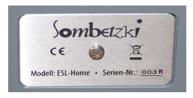
Logo Cover: second connection panel

Please do not forget to screw on the cover (LOGO) of the unused panel before restoring the power supply. Never operate your ESL HOME without this cover.