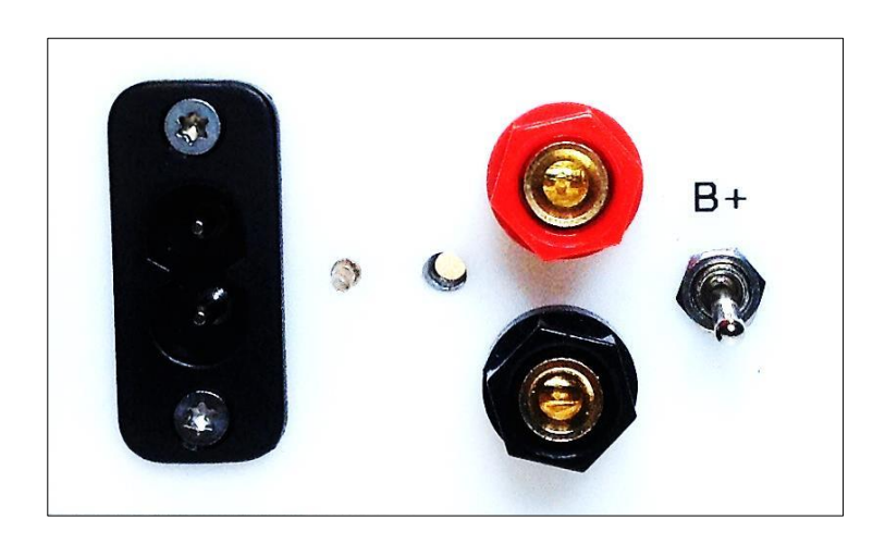
Figure 8: Bass boost

The reproduction intensity of the low frequencies depends on the set-up (see Section 4 ff) and the amplifier used (such as a tube or transistor amplifier). With the switch mounted on one connection panel, the bass can be raised by 3 dB (B + position) in the range of 40 to about 70 hertz.