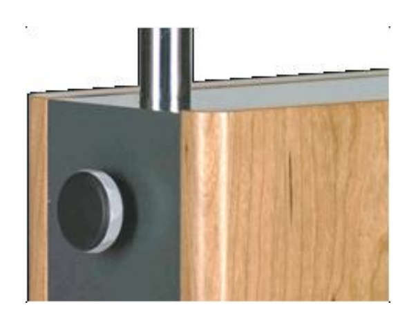
Figure 6: Handwheel on electronic housing