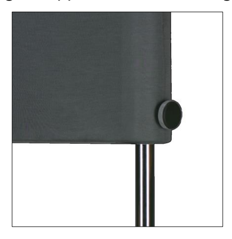
Figure 5: Hand wheel on head

The optimum listening position relative to the height is located in the middle of the transducer. The loudspeaker head is height-adjustable so that you can adjust your center position on different seating areas. You will find a hand wheel on the pipe side of the head. Rotate to the left to loosen it. Now you can touch the head with both hands and move up or down and then tighten it by turning the wheel to the right. The displacement range is approx. 20 cm. (See figure 5).