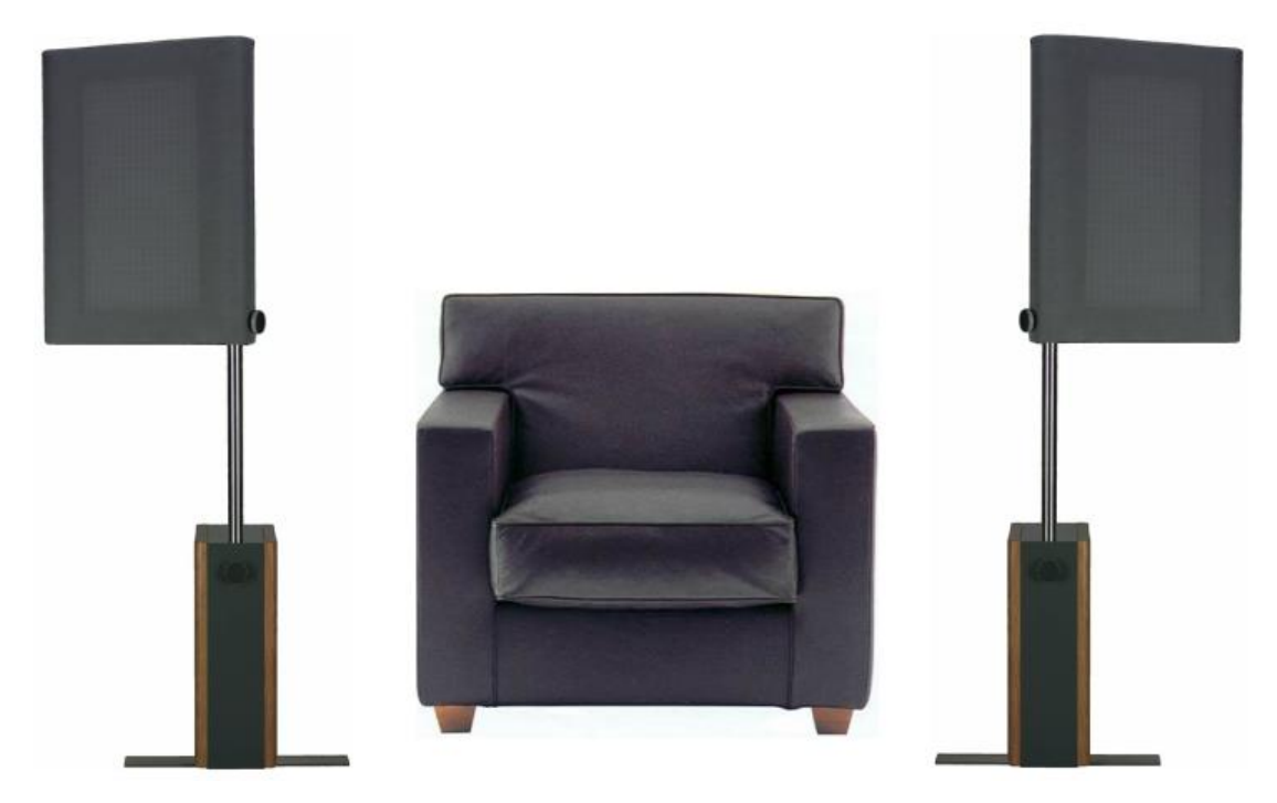
Figure 3: Installation at the listening position (single user)