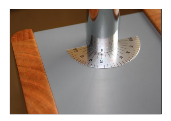
Figure 7: Setting aid angle scale