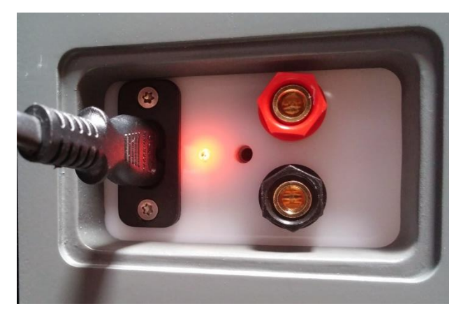
Figure 2: One of two connection panels

Please note the maximum power rating of the ESL HOME when connecting your amplifier (see technical specifications). To achieve the highest sound quality, high quality amplifiers should be selected. The ESL HOME is not "impedance critical". Both tube and transistor amplifiers are suitable. "Single Ended" amplifiers have been successfully tested.